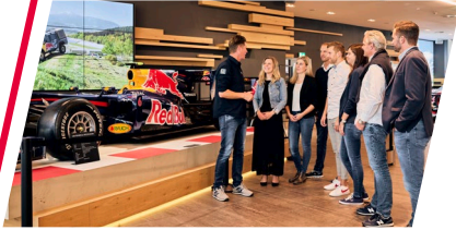
RED BULL RING / WELCOME CENTER

UNTIL 10:00 ARRIVAL AT THE RED BULL RING