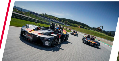
DRIVING CENTER PRICE: 5 x € 950.00..... € 4,750.00 PERSONAL INSTRUCTOR ..... € 661.20 PERSONAL SUPPORT ..... € 421.20

14:00 – 17:00 KTM X-BOW OR PORSCHE 718 S