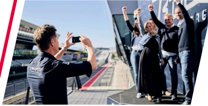
RED BULL RING PRICE: 30 x € 18.00..... € 540.00