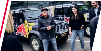
DRIVING CENTER 3 GROUPS OF 10 PEOPLE

13:00 – 14:00 BRIEFING AND DIVISION INTO GROUPS