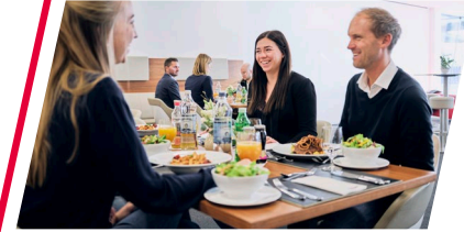
BULLS LANE RESTAURANT PRICE: 30 x € 31.00..... € 930.00