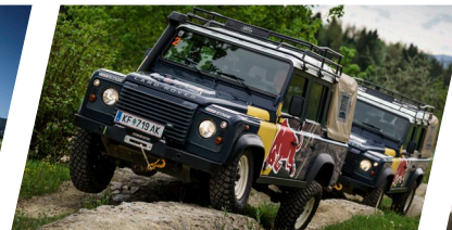
4WD TEST TRACK PRICE: 5 x € 760.00..... € 3,800.00 PERSONAL INSTRUCTOR ..... € 661.20